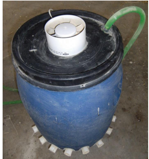
Figure 1. Designed ammonia trap system

used as a main body of the system which capacity is approximately 0.07 \text{ m}^3 (Figure 1). The volume of the system is not critical, it can be selected any size, but the bigger capacities results the better reducing effects of ammonia.