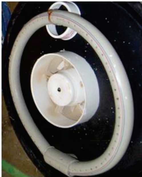
Figure 3. Solution distributor

Although any type of acid solution even water can be used in the system. In the room temperature more than 500 litre of ammonia gas can be solved in the water; however, acid solutions are more effective and by product can be used in agricultural system as fertilizer.