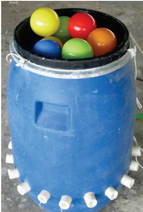
Figure 2. The balls used in the barrel

In the preliminary experiment 5 M of phosphoric acid solution was used. Expected reaction in the barrel is presented was: