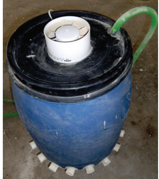
Figure 4. Complete system with fan