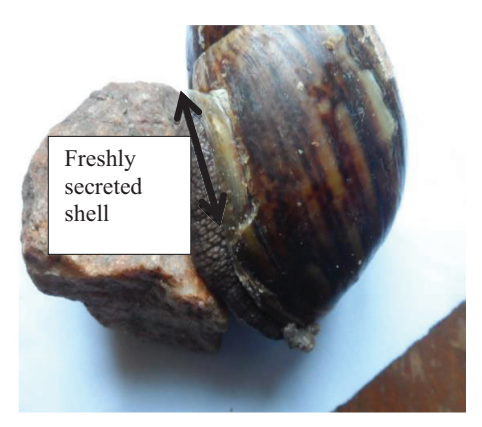
Figure 2. Freshly secreted shell after shell damage

It was obvious that snails with 3 cm shell damage had the highest regrowth of 0.444 cm, followed by 1 cm and 2 cm shell damage which were not significantly different from each other (0.241 vs 0.347 cm) while the control had the least growth (0.175 cm).