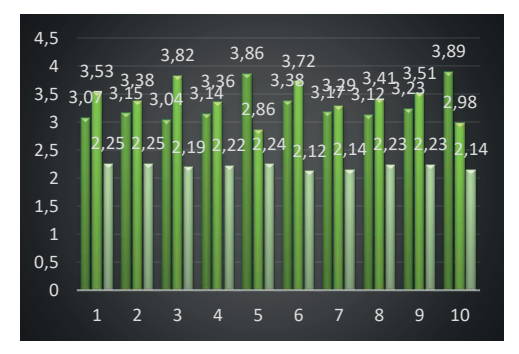
Figure 1. Weight of larva V age (g)

Figures 1 and 2 show higher values of signs under the action of the added extract to the larval feed. The results obtained by us confirm those of Murugesh, (2007), that Tribulus terrestris extract significantly increases larval mass. The controls show slightly lower values.