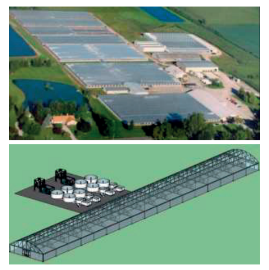
Figure 3. Commercial aquaponics system

Harvesting and packing vegetables are also quite labor intensive (Tokunaga et al., 2015) estimated that labor costs were 46% of total operating costs and 40% of total annual costs. This is quite high compared to other forms of aquaculture and prospective aquaponics