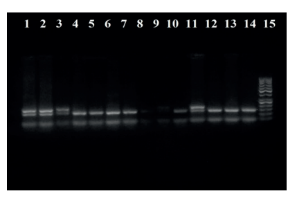
Figure 3. Restriction fragments of FABP3 gene visualized on 2.5 % agarose gel under UV light. Lane 1, 2, 3, 9, 11 heterozygous genotype AG ; lane 4, 5, 6, 7, 8, 10, 12, 13, 14 - homozygous genotype GG ; lane 15 - DNA marker 50 bp

All samples were digested with BseDI restriction enzyme. Two alleles G and A were detected. The digestion of the PCR products of three different fragments (143, 43 and 36 bp) produced mutant allele G and the digestion of the amplification products of two fragments (186 and 36 bp) produced wild allele A (Figure 3).