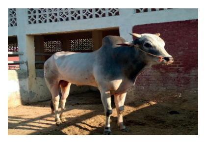
Figure 3. An elite specimen of Dajal Cow being reared at a private farm of Fazilpur, Dera Ghazi Khan, Punjab, Pakistan

Average body weight of Dajal breed is 550 kg to 650 kg of weight in mature bulls and 350 to 450 kg in cows. Cows are low yielder of milk and 1121±92 liters of milk per lactation have been reported (Aslam et al., 2002; Kenyanjui et al., 2009). A rough estimate of 72 thousand heads of Dajal has been reported (Khan et al., 2008).