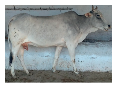
Figure 2. An elite specimen of Dajal breeding bull being incorporated in the present study reared at the Semen Production Unit, Karaniwala, Cholistan, Punjab, Pakistan