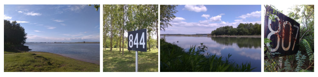
Figure 2. Views from Danube River, Kudelin and Koshava biotopes; left to right