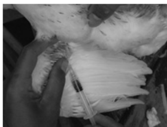
Take a blood from vena pectoralis