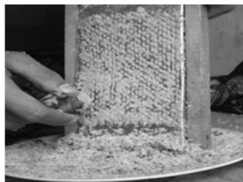
Prepare Alpinia galanga for juice