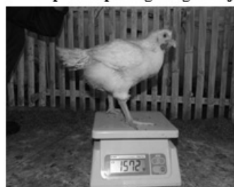
Body weight 5 weeks old